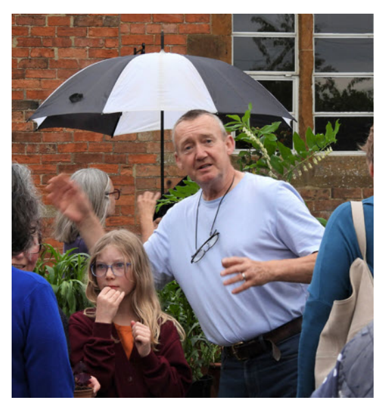
Garden Club Plant Sale

Don't forget the Village Fete on 3rd September at Newborough House - save the date!